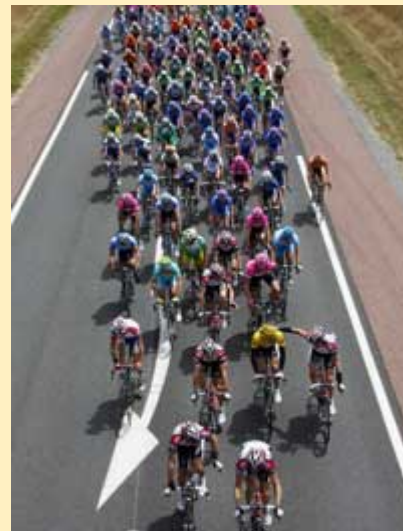
Zabriske in Yellow