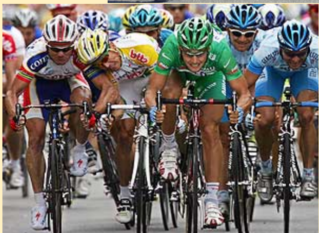
In a Cuddling Mood